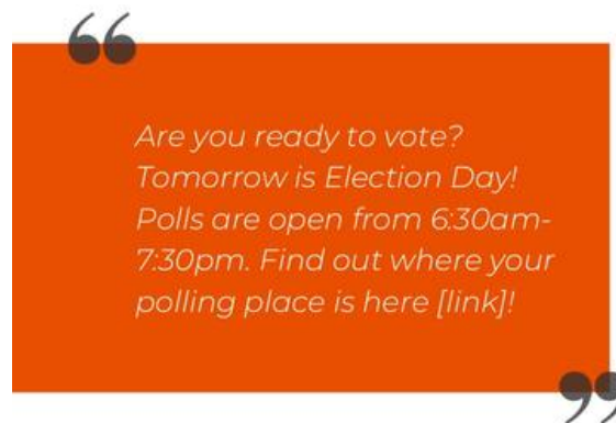
Sample Text Message

Text: That's it! Now all your Campus Team needs to do is text! Because texts are much shorter than emails, you can write and send them out quickly, especially if you have breaking news to share. Create a communications plan and outline when you want to send texts about voter registration deadlines, early voting periods, GOTV reminders for Election Day, your Campus Team's events, and more. You should also include your my.VoteEverywhere link in your texts so that your subscribers can go to your page and browse additional resources!