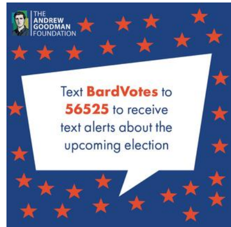
Sample Social Media Graphic

(If anyone wants to be removed from your contact list, they can simply opt out.)